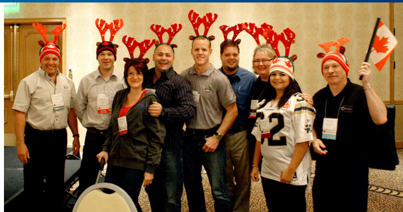
A fun-hearted group represented Canada at the Leadership Conference.

With regard to ARA resources that can help members, it was noted that there has been a low rate of participation in the biannual Cost of Doing Business Report from some regions, Ontario included, which prevents the report from being of greater value to all of us. Having seen the results of the last report, I encourage you to fill out the short questionnaire and return it when it arrives in early 2011. It really is as simple as answering a few questions and submitting