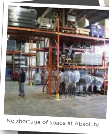
No shortage of space at Absolute