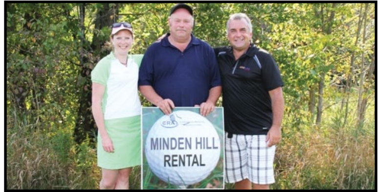
Minden Hill rental was one of the many sponsors.

We are looking forward to seeing you on The Links next September.