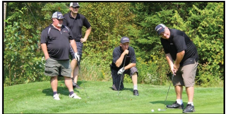
I think it breaks six inches to the left.