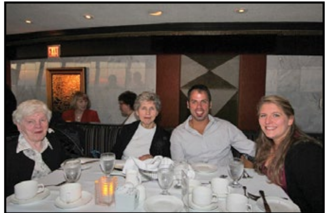
We're hungry – let's get this dinner started!