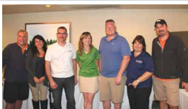
The CRA Ontario Golf Tournament organizing committee.