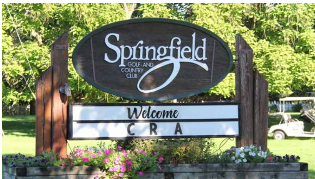
Springfield Golf & Country Club hosted the CRA Ontario gold tournament.