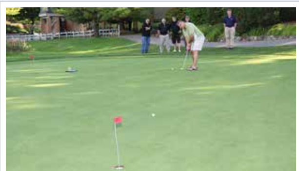
The putting contest came down to a nail-biting putt-off.