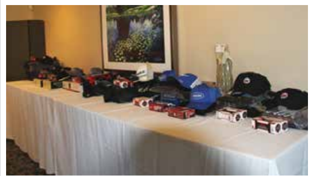
The prize table was overflowing as usual.