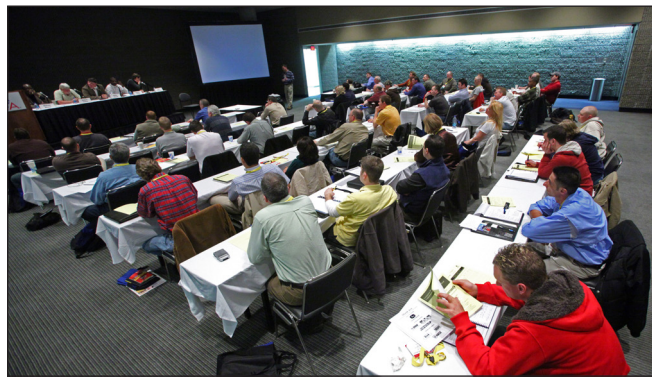
Construction U contractor perspective forum at The Rental Show