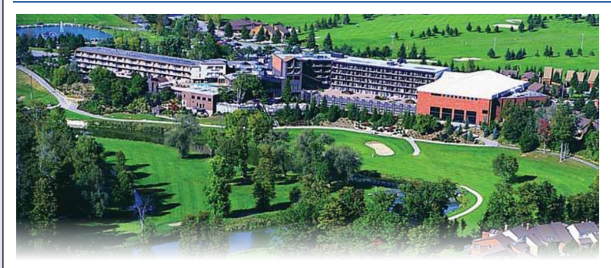
TABLE TOP TRADE SHOW

Your hard-working executive of the Ontario Canadian Rental Association is planning its table top trade show. This event runs every other year on opposite years that the Canadian Rental Mart takes place. Our one day event will be Saturday,